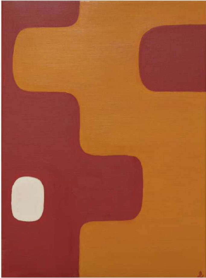
R4, cyklu „Formy”