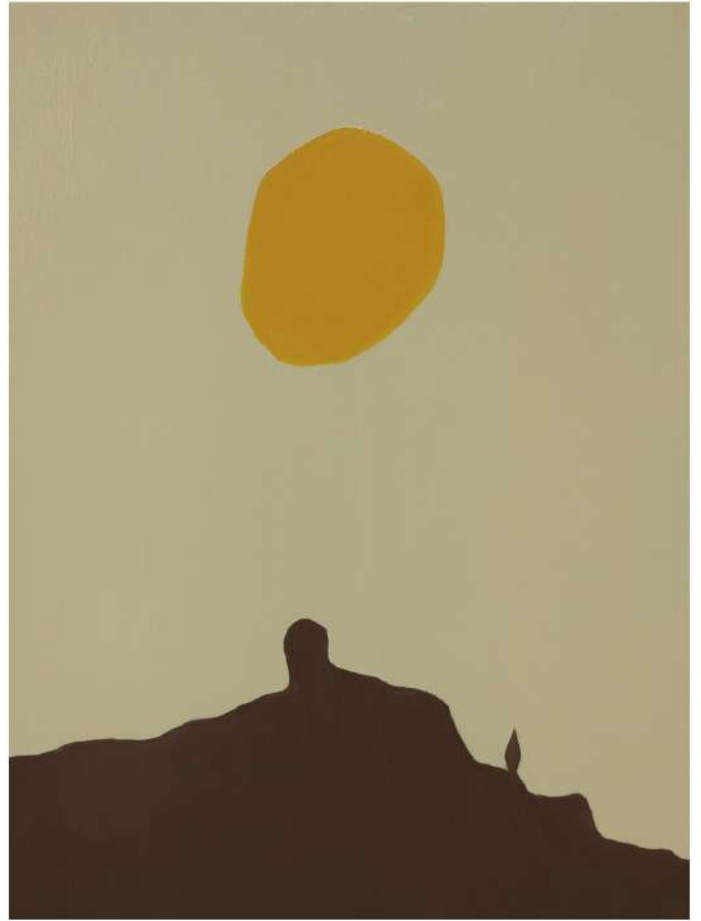
W3, z cyklu „Formy”